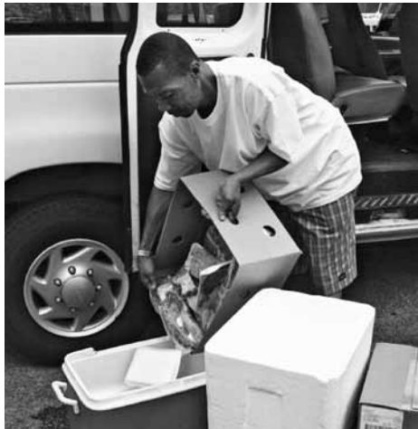
A pantry volunteer transfers packages of meat into coolers, ensuring safe delivery.

After piloting the process in two stores selected by Schnucks, the program was