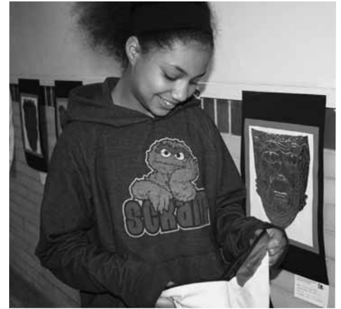
Checking out Operation Backpack food contents

O peration Backpack just wrapped up for the 2010-2011 school year. We are pleased to report that this weekend feeding program successfully provided healthy meals and snacks to supplement the nourishment of nearly 3,000 children in the St. Louis community. At the conclusion of the school year, one-on-one student interviews were conducted and parent and school coordinator surveys were distributed and collected with very positive feedback from everyone involved. We were delighted to receive handmade thank you cards from the children showing their appreciation for Operation Backpack. The majority of the schools that participated in the backpack program will continue this fall, and we are hopeful to continue expanding Operation Backpack partner schools.